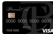
Credit Card or Bank Passbook