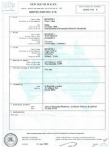
Australian Birth Certificate