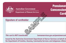
Social Security Card