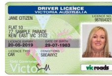
Driver's Licence / Learner's Permit