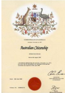
Australian Citizenship Certificate