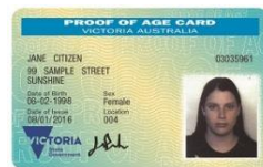
Proof of Age card

Up to 2 documents from Category 3 (or you can use more documents from Category 1 and 2)