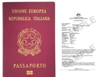
Foreign Passport (with current Australian Visa or Visa Grant Notice)