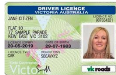
Australian Driver's Licence / Learner's Permit