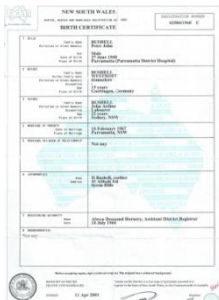
Australian Birth Certificate