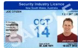
Security Guard Crowd Control Photo Licence