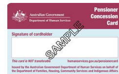
Pensioner Concession card Health Care card Seniors Health card Department of Veterans' Affairs card