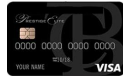
Debit / Credit card

Up to 2 documents from Category 3 (or you can use more documents from Category 1 and 2)