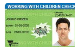
Working with Children Check card